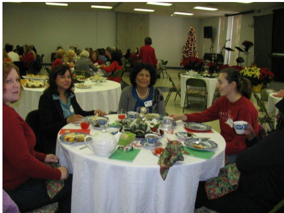
Ladies enjoy treats and fellowship at the 2010 Women's Ministry Christmas Event.

Also, do a little Christmas shopping at the "Wonderfully Made Jewelry" booth. Beautiful jewelry is made by women from Thailand and other countries who are survivors of trafficking and exploitation. Representatives from the organization will be on hand to answer questions about this ministry that brings hope to abused women.